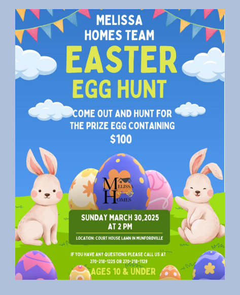
Melissa Homes Team is hosting an Easter Egg hunt with a $100 grand prize!