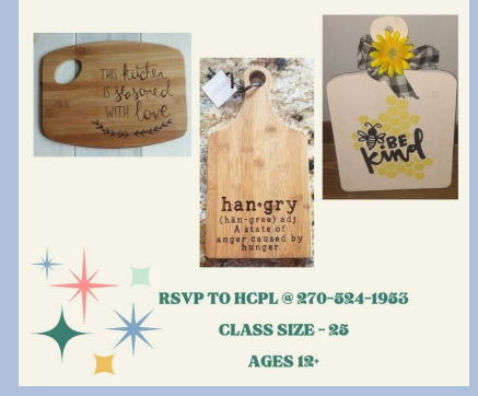
Learn the art of wood scorching and create your own custom design.