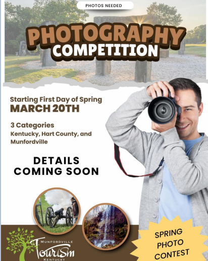
Strike a pose! Munfordville Tourism is hosting a photo